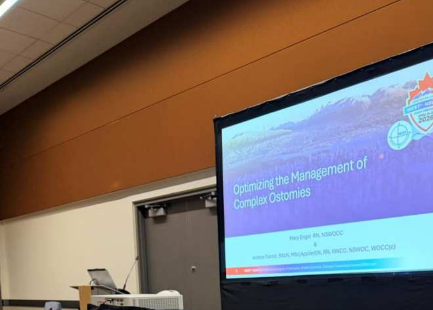
Workshop-Complex ostomy care