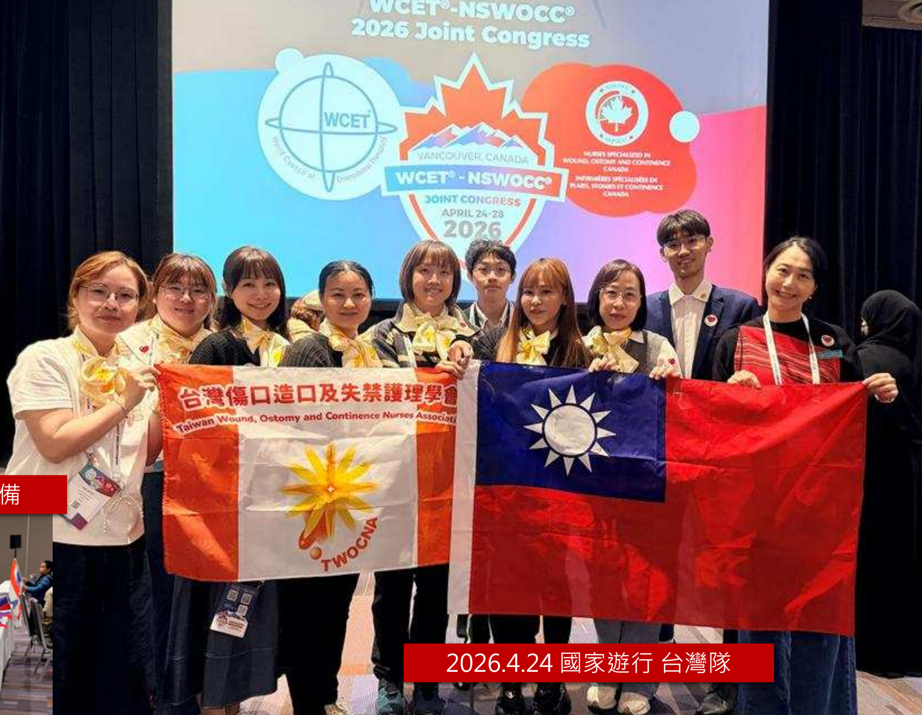
2026.4.24 國家遊行 台灣隊